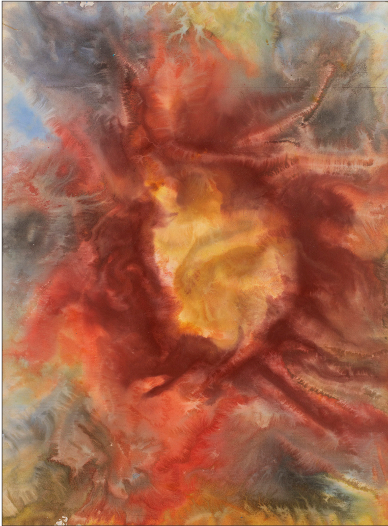
Club , by Brian McPartlon (see page 4)